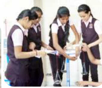
Engineering Mechanics Lab.