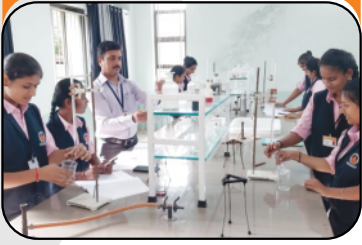
Engineering Chemistry Lab